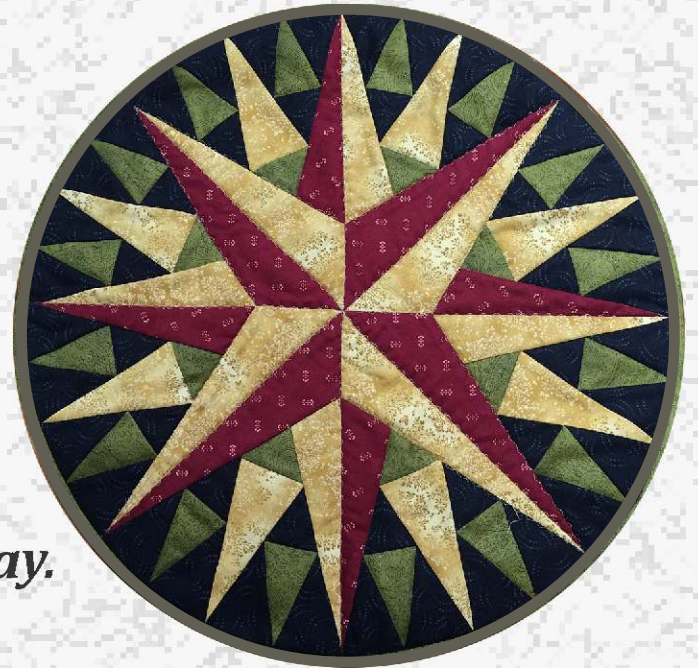
East Coast Compass