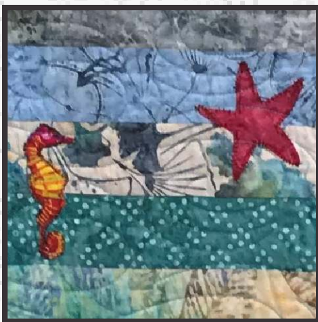
Mermaid Among Corals