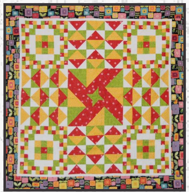
Practice Makes Perfect