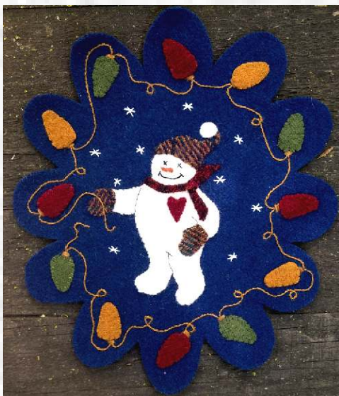
Circle of Light One Starry Night