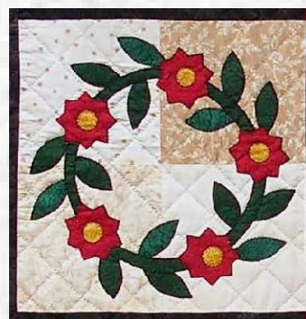
Baltimore Christmas Block