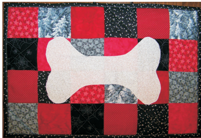
Bow Wow Kennel Quilt